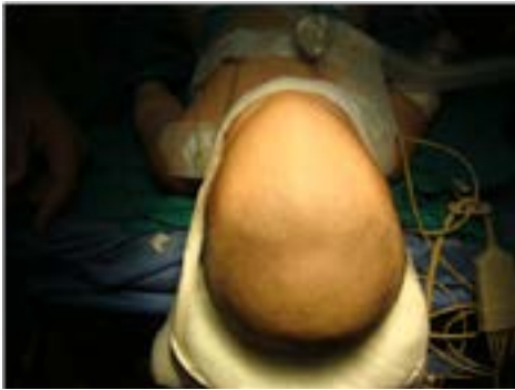
Figure 1: Patient in an operative bed shows an inverted V-shaped abnormality in the front of the skull.

case of more complex craniofacial syndromes, in the possibility of offering minimally invasive techniques through endoscopically assisted osteotomies for some of these malformations it allows reducing the number of complications, as well as shortening the surgical time, blood loss and postoperative hospital stay compared to conventional craniofacial surgery techniques.