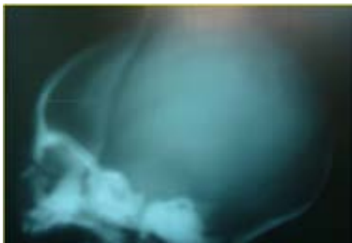
Figure 3: Bone structures in normal facial massif.