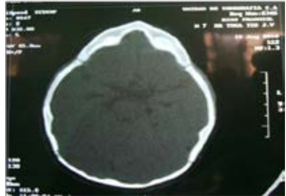
Figure 4: Deformity characterized by pointed frontal region was evidenced.