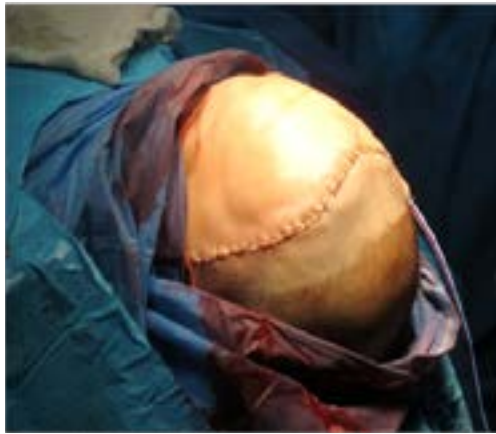
Figure 8: Performs synthesis of operative wound by planes.