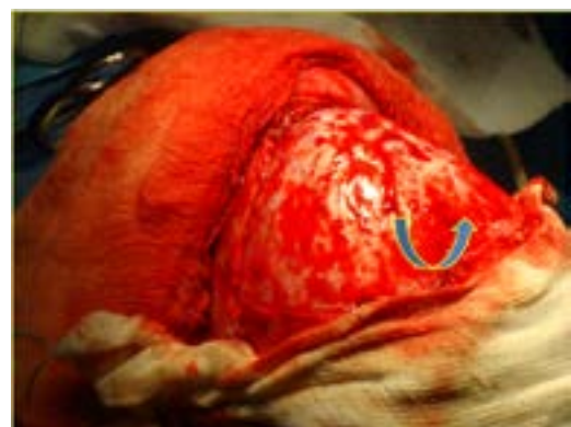
Figure 6: Soft flap towards the face, holes of parasagittal and paratemporal trepans are made.