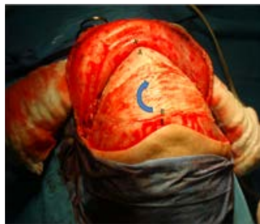
Figure 5: The surgery is to perform a complete frontoorbital osteotomy in addition to the resection of the metopic suture, which includes both orbital ceilings and the pterional region, a forehead remodeling occurs.