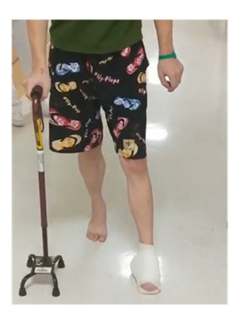
Figure 3: 3 days after echo guide botulinum toxin type A injection therapy. Patient could use quad cane with orthopedic insole walking independently