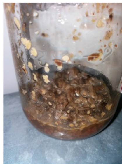
Figure 1: Apocrine glands illustrated immediately after home microwave oven at 2.45 GHz,800W, for 20 seconds

Microwave therapy is used to treat hepatocellular carcinoma and prostate hyperplasia leading to coagulative necrosis in cells [3, 4]. Histologically, coagulative necrosis is also seen in microwaved apocrine glands (Figure 2). We consider microwave therapy can potentially be useful to treat bromhidrosis, but with a risk of relapse in 2-3 months' time due to regrowth of the apocrine glands. Further studies in the usage of microwave therapy would increase the field of knowledge in this procedure.