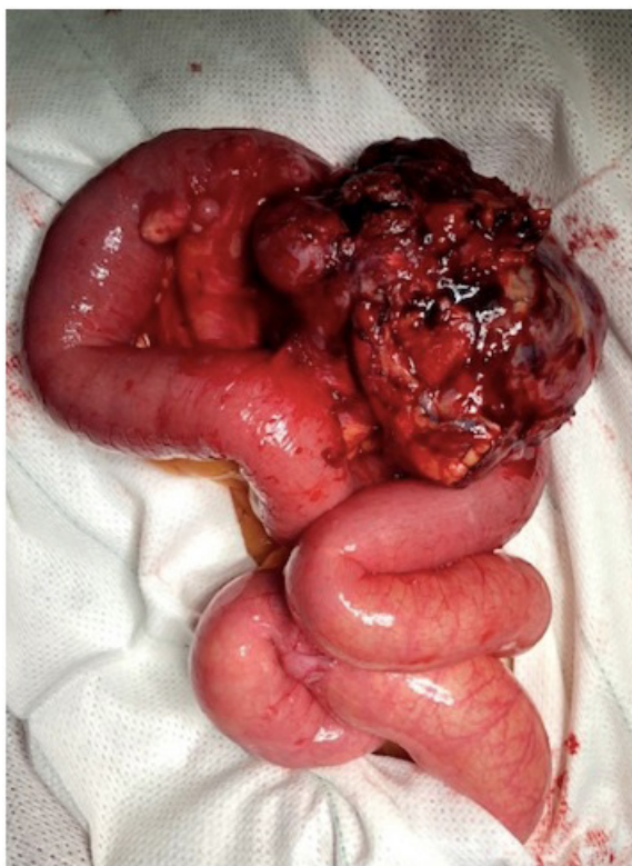
Figure 3: Large intestinal GIST