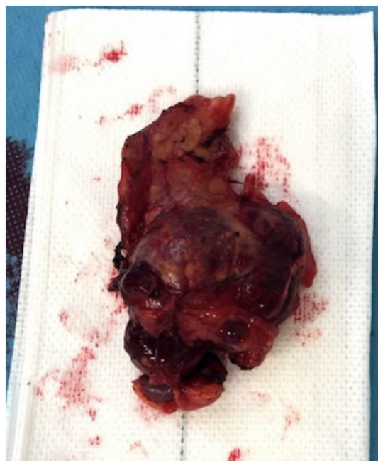
Figure 5: Resected left adrenal tumor

During preparation of the left adrenal gland a hypertensive crisis occurred resulting in hypotension after adrenalectomy. Both could be resolved by anesthesiological intensive care support. The resected tumor from the left adrenal gland had a maximum diameter of 5 cm (Figure 5). Microscopic and immunohistochemically examination confirmed pheochromocytoma with expression of both S100 protein and Chromogranin-A. All intestinal tumors proved to be gastrointestinal stromal tumors and established by positive staining to CD 117 and negative to S100. Molecular analysis of KIT (exons 9,11) and platelet-derived growth factor receptor-alpha (PDGFRA) revealed no somatic mutations. There were no post-surgical complications, except superficial infection of the surgical wound, and the patient was released 10 days after the procedure. Seven months after surgery, a routine control PET/CT scan showed nodular lesion in the jejuna loop wall, distal to the Treats angle without metabolic characterization.