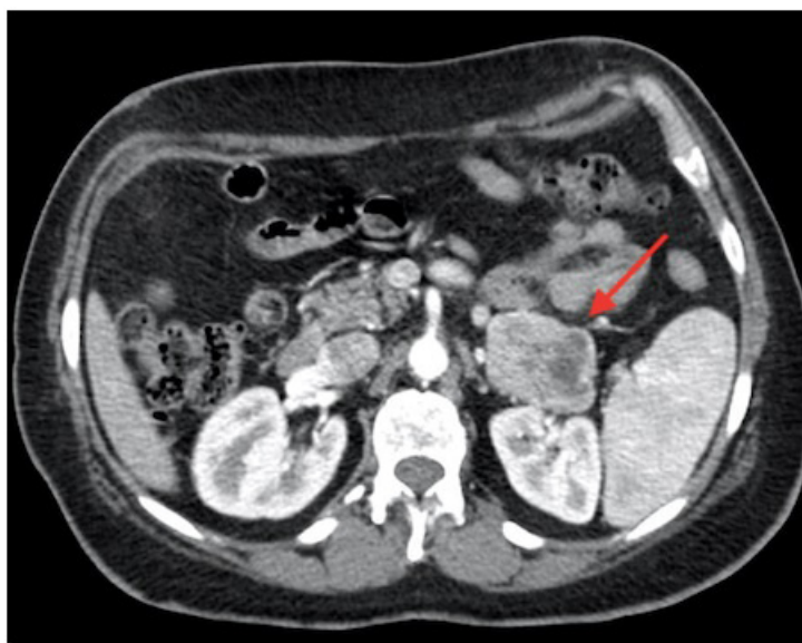
Figure 2: Abdominal CT: expansion of the left adrenal gland (red arrow)

According to the multidisciplinary (gastroenterologist, oncologist, radiologist, endocrinologist and surgeon) committee's decision, the patient was advised to undergo a surgical treatment. After preoperative preparation with \alpha - and \beta -adrenoreceptor blockade, an open surgery was performed. Both adrenal tumor and approximately 70 cm of the small intestine was removed by resection of a