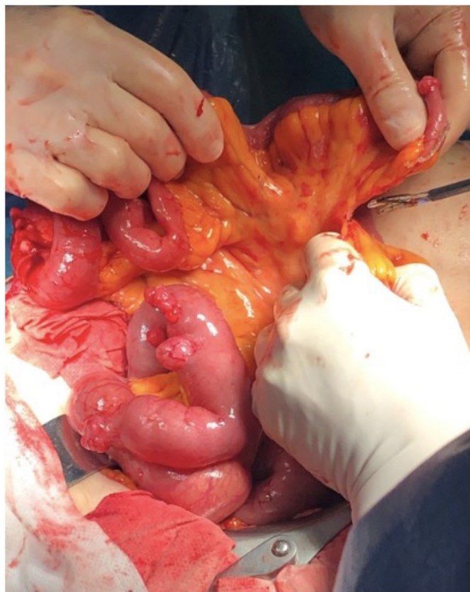
Figure 4: Several small ideal gastrointestinal stromal tumors

During preparation of the left adrenal gland a hypertensive crisis occurred resulting in hypotension after adrenalectomy. Both could be resolved by anesthesiological intensive care support. The resected tumor from the left adrenal gland had a maximum diameter of 5 cm (Figure 5). Microscopic and immunohistochemically examination confirmed pheochromocytoma with expression of both S100 protein and Chromogranin-A. All intestinal tumors proved to be gastrointestinal stromal tumors and established by positive staining to CD 117 and negative to S100. Molecular analysis of KIT (exons 9,11) and platelet-derived growth factor receptor-alpha (PDGFRA) revealed no somatic mutations. There were no post-surgical complications, except superficial infection of the surgical wound, and the patient was released 10 days after the procedure. Seven months after surgery, a routine control PET/CT scan showed nodular lesion in the jejuna loop wall, distal to the Treats angle without metabolic characterization.