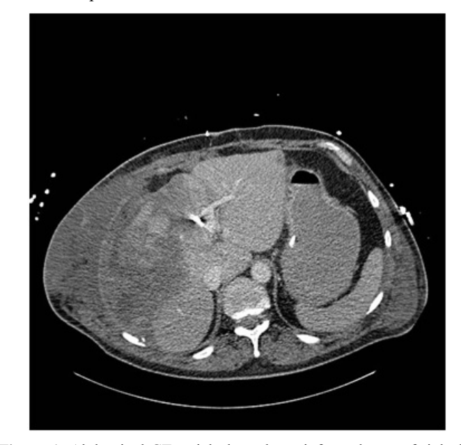
Figure 1: Abdominal CT, axial plane: large infarcted area of right liver with embolisation material seen in the right hepatic artery course.