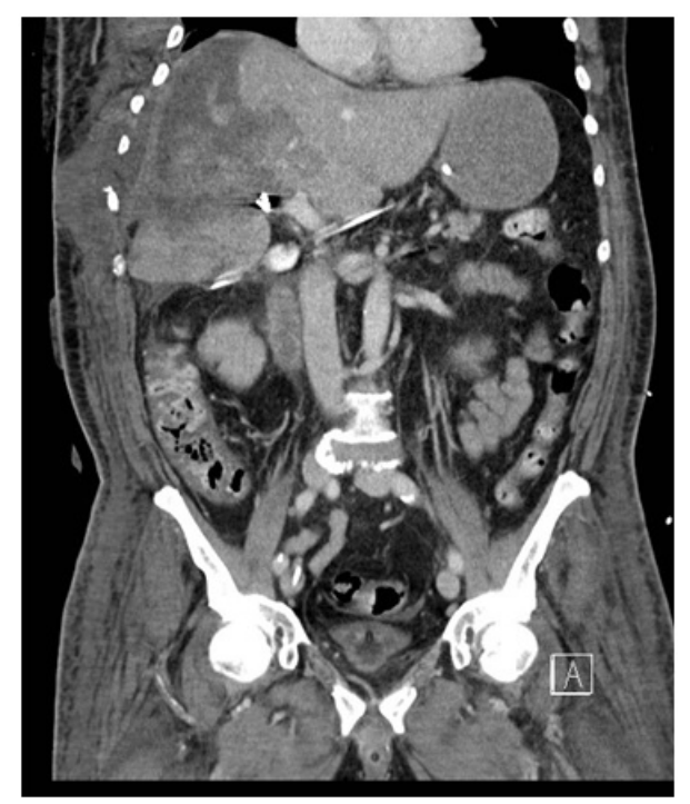
Figure 2: Abdominal CT, coronal view: Large infarcted area of the right liver.