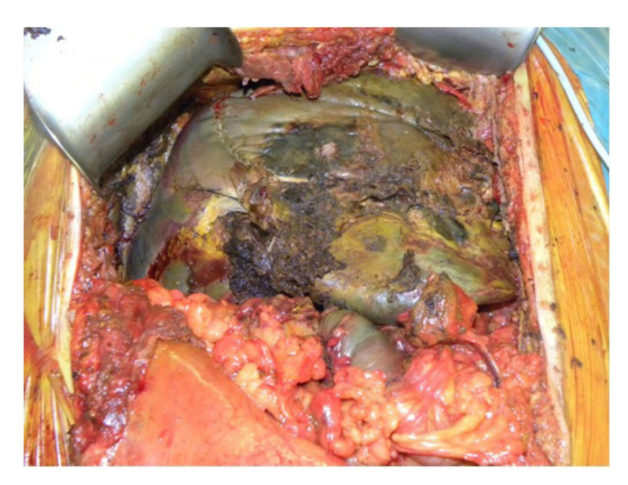
Figure 3: POD 14, situation in the abdomen before total keratectomy and LT: extensive liver necrosis, ischemic segment of the transverse colon.