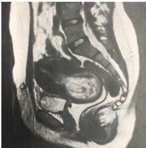
Figure 1: Pelvic MRI. Sagittal T2 weighted images at midsagittal plane showing a pelvic mass with heterogeneous low signal inside the cervix, without clear invasion of adjacent pelvic structures.

A forty-year-old healthy woman with one previous cesarean-section and one spontaneous abortion presented with abnormal uterine bleeding and dysmenorrhea. She had undergone an open myomectomy the previous year, but maintained increased uterine bleeding, associated with anemia requiring blood transfusion. She responded poorly to clinical treatment with combined oral contraceptives, progestins and non-steroid anti-inflammatories. Diagnostic hysteroscopy revealed a type II submucous myoma with two centimeters, occupying the entire uterine cavity, emerging from the right anterolateral wall. The uterus Pelvic Magnetic Resonance Imaging was in anteversion and measured 104x60x59 mm. The study evinced a 16 mm submucosal myoma and a solid intra-uterine expansive formation measuring 67x52x51mm, located in the isthmus-corporeal transition, extending to the uterine cavity ( Figure 1 ). Upon physical examination, it was possible to visualize the myoma through the external orifice of the cervix.