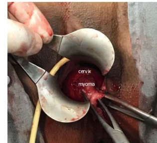
Figure 3: Removed uterine leiomyoma.