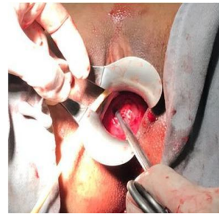
Figure 2: Intraoperative images: myoma visualized at the level of the external orifice of the uterine cervix.

After the three months of surgery, control imaging revealed full recovery. hysteroscopy showed a uterine cavity with no abnormalities and Pelvic Magnetic Resonance Imaging was normal ( Figure 6 ). She was then released for sexual activity and attempt at pregnancy.