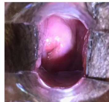
Figure 6: RNM pos.