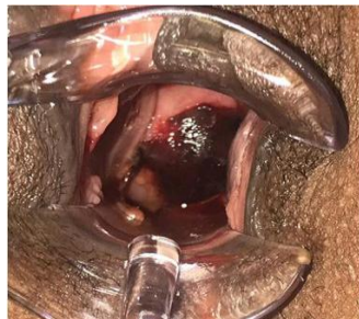
Figure 5: Physical examination on the 30th day after surgery.